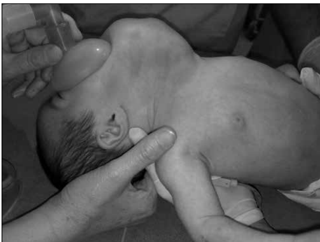
Figure 3. Ventilation with mask

the mass, and intubation was performed by two anaesthesiologists, one of them helping positioning by lifting the neck. Five percent sevoflurane in 100% oxygen was applied through a facemask, while the baby was breathing spontaneously (Figure 3). Laryngoscopy was difficult because the mass was pushing the tongue up from the floor of the mouth.