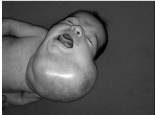
Figure 2. The image of patient in preoperative period